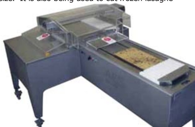
AES Multicut – A Specifically designed Two-way slice cutter for Slice Cake and Sponge in slab form, offering a choice of cut size. It is also being used to cut frozen lasagne