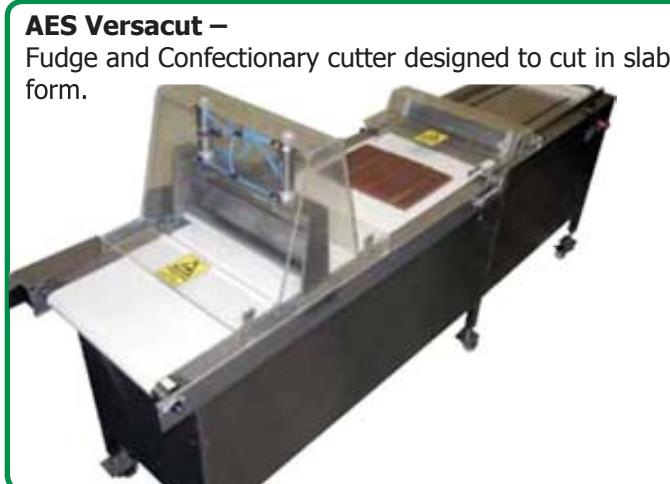
AES Versacut – Fudge and Confectionary cutter designed to cut in slab form.