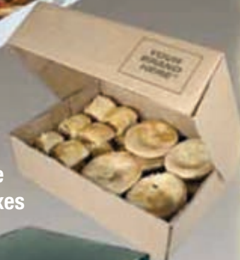
Bulk Cake/Pie Transport Boxes