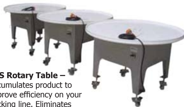
AES Rotary Table – Accumulates product to improve efficiency on your packing line. Eliminates bottle necks.

Ask about out leasing, lease-to-buy and financing options on your new AES machinery.