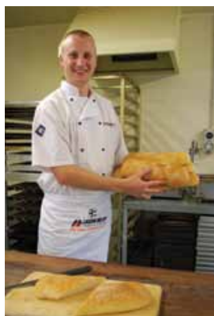
Recipe by Hayden Campbell courtesy of Weston Milling.