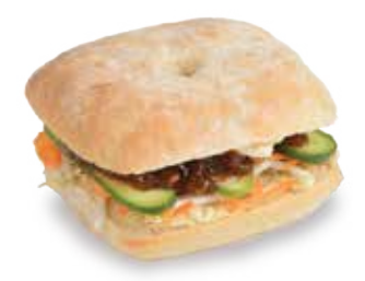
Roll Hummus, sprouts, grated carrot, cucumber Roasted vegetable chutney