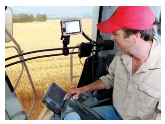
GPS in a combine.

Whilst the returns per hectare of wheat must remain relevant for growers, ownership of a flour mill has made the same growers more acutely aware of the wheat characteristics required to produce stronger flours.