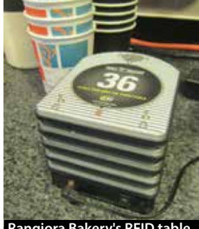
Rangiora Bakery's RFID table discs.

Each customer is handed an RFID disc as they place and pay for their order at the counter. They take that disc and place it on their table. Underneath the table is a whole pad of sensors and as soon as the tracker is placed on the table, the sensors pick up a signal and transmit that to a computer with a 46-inch TV screen. It's then projected onto the screen, which features a blueprint of the table lay-out, showing staff exactly which table that order needs to go to.